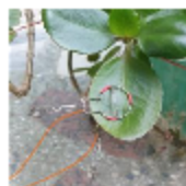
The coupled probes on a leaf

In fact, the LT-12T Sensor can measure leaf temperature as accurately as the LT-1T Sensor. And, when coupled with another LT-1T sensor, both can be used to measure either the leaf-air temperature difference or the temperature of two leaves.