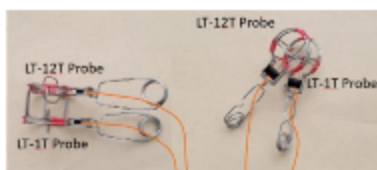
The coupled LT-12T and LT-1T Probes