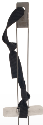
CS650G Rod Insertion Guide